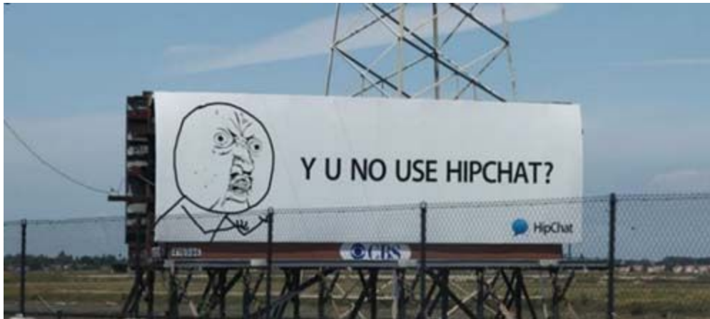
HipChat advertisement as seen on a billboard in San Francisco

One of the most notable examples of how memes can be used to market a product effectively came from HipChat- a startup company offering instant messaging services. As a marketing experiment, HipChat decided to use their own version of the infamous "Y U NO GUY" [6] meme and put a message on one of the billboards in San Francisco that simply asked bypassers "Y U NO USE HIPCHAT?"